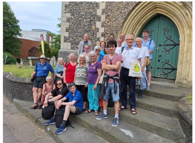
Outing members outside St Laurence

The second tower was St. Laurence. I had never rung on 12 bells but with encouragement I gave it a go and rang on 4 for rounds successfully. It might be nothing to experienced ringers but it was quite an achievement for me.