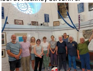
Students at the Hackney local Summer School