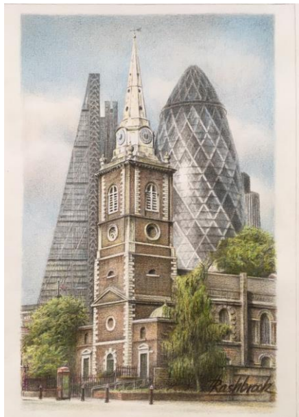
St Botolph, Aldgate

Some of my artwork featured on a new leaflet celebrating the Association's 125th Anniversary, and I'm delighted to present a further selection in Bell News of Middlesex tower drawings.