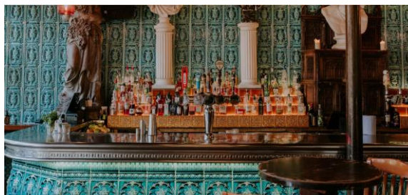
Cr: Old Queen's Head, Islington 44 Essex Rd, N1 8LN

Post-performance pub. The Old Queen's Head, a splendidly bizarre kitsch antique interior, but lacking the real ale that would have given it a maximum: 9/10.